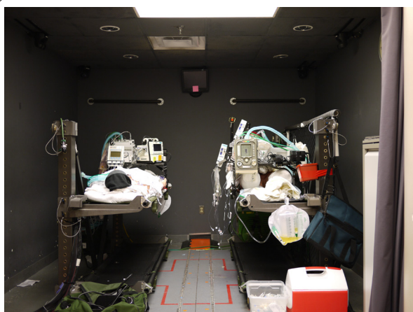
Figure 1. View of the simulation laboratory under full light conditions.

The study was performed in a high-fidelity patient simulator lab, which is used for patient care simulation in the CCATT Advanced Training Course at UCMC. This area permitted use of the lab's standard white room lights for the "lights-on" portions of the study (Figure 1) and the existing green ceiling lights for the "blackout" portions, which simulates the conditions in an aircraft during takeoffs, landings, and night missions in a combat zone (Figure 2). The simulation lab is windowless, and the door does not permit light entry when closed. A manikin (HPS, CAE Healthcare USA, Sarasota, FL, USA) was placed on a standard North Atlantic Treaty Organization (NATO) patient litter in a standard U.S. Air Force patient transport pallet stanchion at a height of 36 inches from the ground. The manikin was placed to approximate the position of a patient undergoing CCATTs transport in the supine position. A second manikin (Ambu Airway Man, Ambu A/S, Ballerup, Denmark) was placed on the ground next to the stanchion to approximate the position of a CCATTs team-transported patient who was floor-loaded, as is often done by